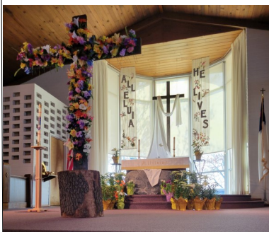
Easter Sunday, 2024