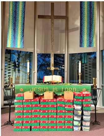
60 Shoeboxes were collected in November 2023 for OCC.

A special Pastor's Discretionary Fund collection is held during communion on the first Sunday of each month, however, donations can be made at anytime. Please designate Pastor's Discretionary Fund on the giving envelope.