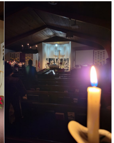
Emilie's Sanctuary - Christmas Eve 2023

We would like to thank everyone who participated in our Advent Missions Collections. They were a huge success, and many people were blessed by your generosity.